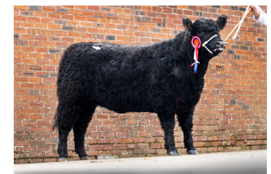
Blackcraig Moss Rose C1253

Thursday 15 th February & Friday 16 th February 2024