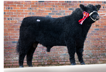
Quattro of Trolosse

40 Bulls & 36 Incalf and Bulling Heifers